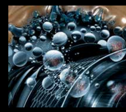
ODS<sup>2</sup> propels DYES and PROTEIN EXTRACTS into the cortex