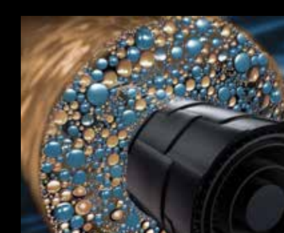
A mixture of DYES, OIL and PROTEIN EXTRACTS surrounds

Hair is 2X fortified*, with long-lasting color and stunning shine.