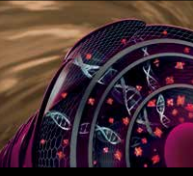
The hair strand is 2X FORTIFIED* and infused with COLOR